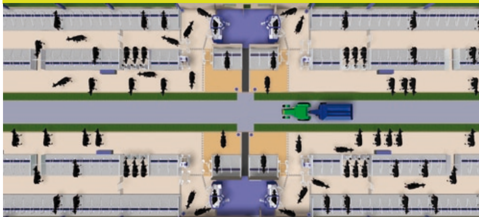
Barn overview showing installation of four VMS and Herd Navigator

* Data source: 4 test and 5 commercial farms in Denmark and the Netherlands running Herd Navigator™, 2009.